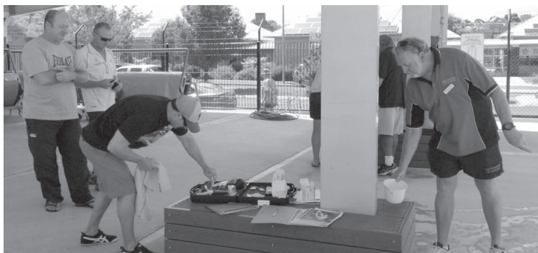
Statewide Water Quality – Parkes