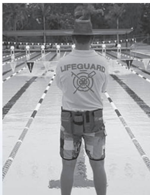
Pool Lifeguard Training