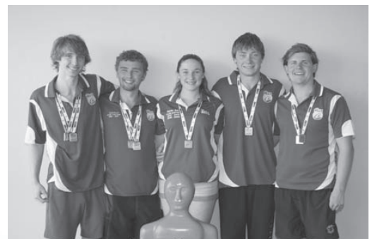
Hills Rescue Interclub