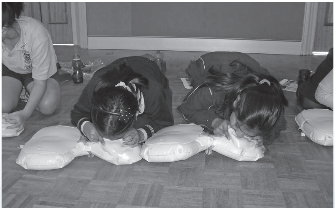
School students practicing CPR techniques