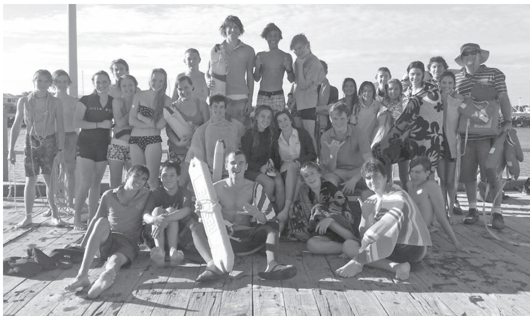
Coffs Harbour High School