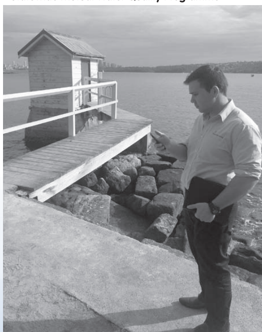
Inland Water Safety Assessment