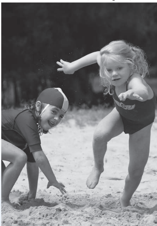
Members of Woronora Life Saving & River Patrol Club enjoying a variety of life saving events.