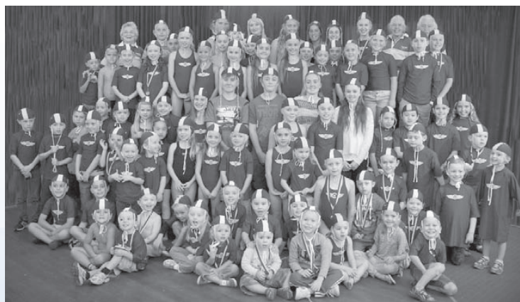
Members of The Woronora Life Saving and River Patrol Club attending presentation day