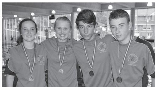
Under 19 SERC Team – Gold Medal Winners