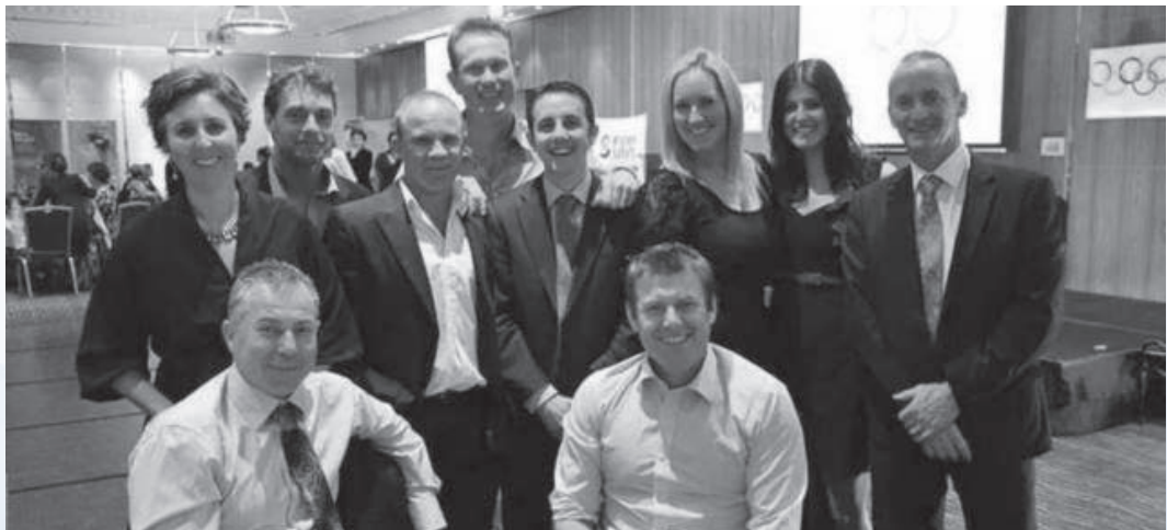
RLS-NSW staff attending the Australian Water Safety Conference