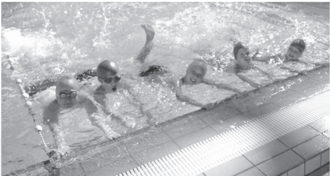
Candidates participating in a Learn-to-Swim Program