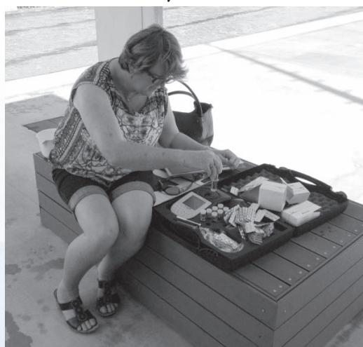
Statewide Water Quality – Parkes