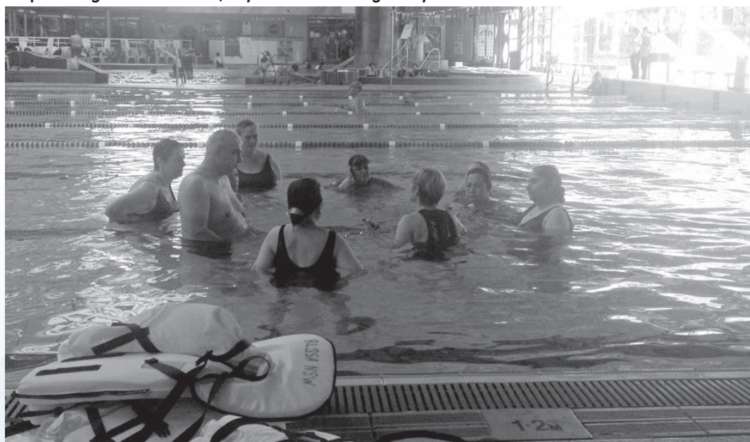
Aqua Health Session