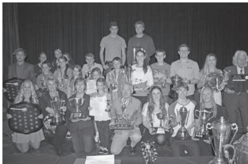
Hills Lifesaving Club