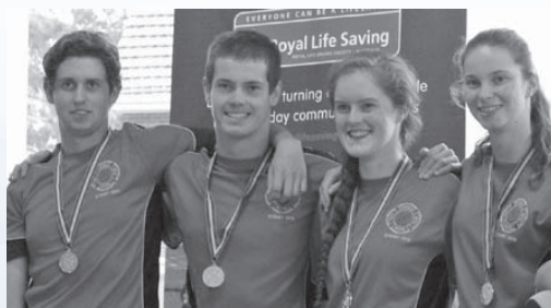
Under 16 SERC Team – Silver Medal Winners