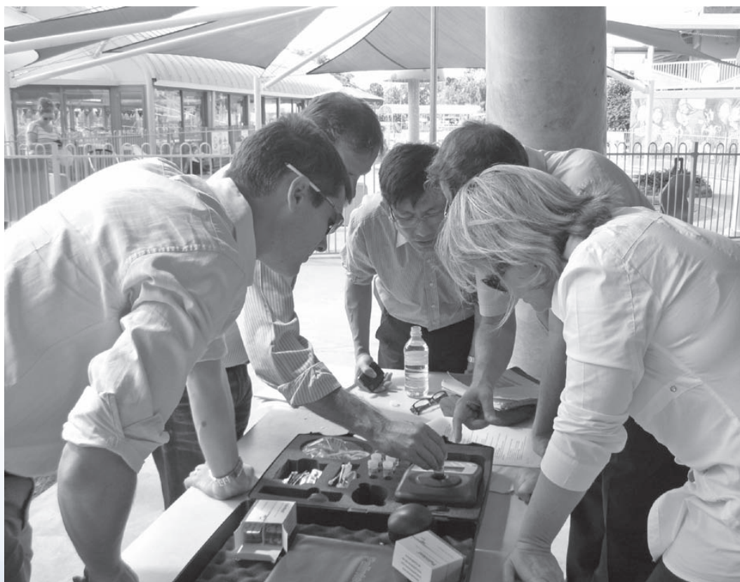
Participants testing the water at one of the Statewide Water Quality Initiative training sessions

In 2012/2013, over 40 Statewide Water Quality sessions took place across NSW, with more than 350 pool staff and environmental health officers in attendance. Royal Life Saving NSW is continuing the initiative into 2013/2014, providing free Statewide Water Quality Initiative training to more council areas across the state. We would like to thank Statewide Mutual for their continued support.