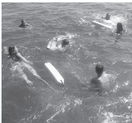
Participants in a River Safety Program