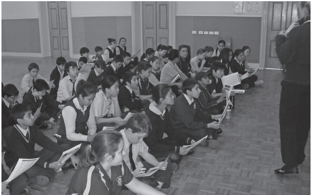
Participants attending a Water Safety lecture