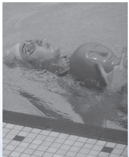
Participants enjoying a Bronze Medallion Course